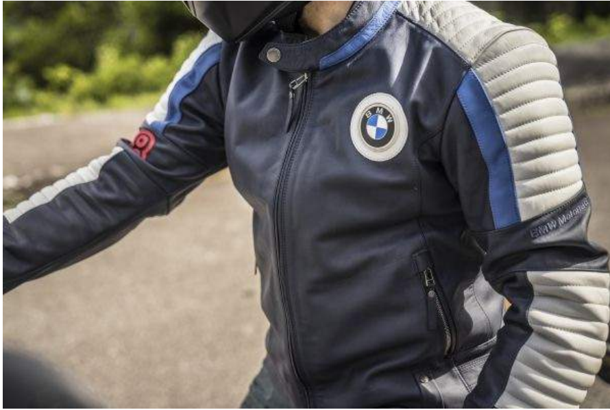
Stylish appearance: the "40 Years" motorcycle jacket.

Heritage designs are the latest thing nowadays, making the "40 Years" motorcycle jacket doubly desirable: it offers timeless throwback style combined with the very latest motorcycle fashion. In the version for men it is limited to 150 items – and only 50 of the women's version will be produced. Anyone able to get hold of one of these unique jackets will be able to enjoy a 1970s look while at the same time benefiting from cutting-edge quality.